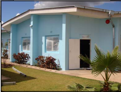
ONE SIDE OF THE NEWTON HALL