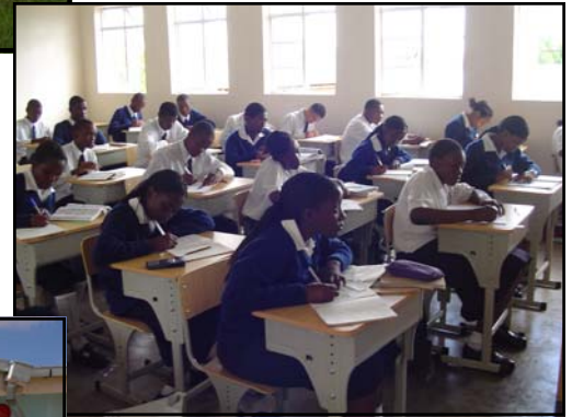
CLASSROOM SCENE - ALL STUDENTS IN UNIFORM