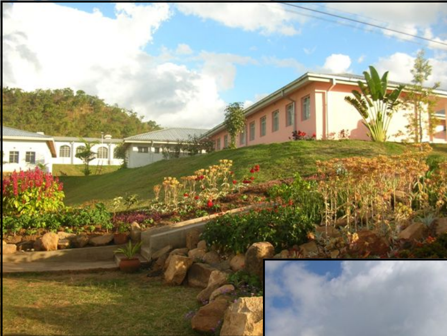
CLASSROOMS ON THE RIGHT AND THE SCHOOL HALL IN THE BACKGROUND.

If you have access to the internet see these photos in color. They are spectacular.