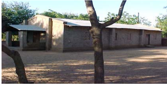
Nsanje Church (measurement 15m by 7metres)

This Church building which is in Nsanje district (southern part of Malawi) is too small when we compare with the number of people which are there. It was built as the centre for all Kalibu churches which are in the Nsanje district.