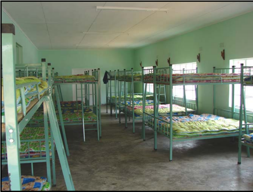
Inside a dormitory. Showers, toilets and lockers are separate and run down the left side of the dormitory. We still need $200,000 to build enough dormitories for the 2008 intake.