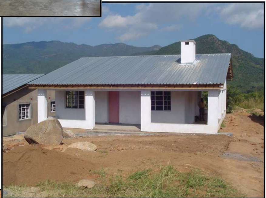
Cottages for staff and visitors consist of bedroom en suite, kitchen and pantry, dining room and living room with a porch running along two sides of the house. The view from the cottages is spectacular.