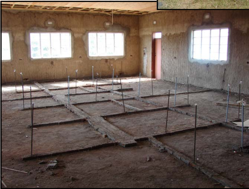
Science laboratories. Our container just arrived from China with much of the science equipment. These need to be operational with the new year in January 2008.