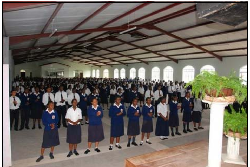
MORNING ASSEMBLY AT KALIBU ACADEMY