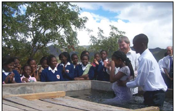
Baptismal service held a week after school opens for all new converts.