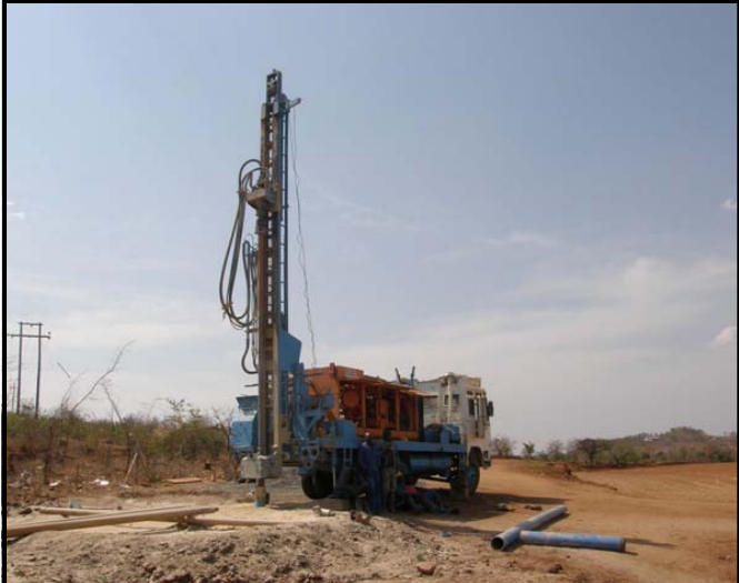
BOREHOLE DRILLING. MANY BOREHOLES HAVE BEEN REQUIRED TO TAKE CARE OF THE AMOUNT OF WATER REQUIRED FOR THE SCHOOL. FORTUNATELY THE SCHOOL IS BUILT ON THE CONFLUENCE OF TWO RIVERS.