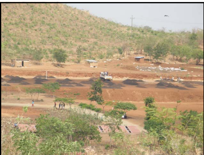
SCHOOL PLAYING FIELDS AND ATHLETIC TRACK. TOP SOIL BEING HAULED IN BY OUR TRUCKS.