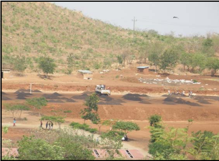
SOCCER FIELDS—BEFORE AND AFTER