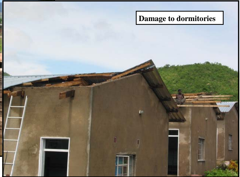
Damage to dormitories