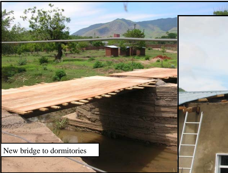
New bridge to dormitories

It happened on 5 th of December, 2009, Saturday evening when the rain started followed by a heavy storm. It was raining so heavily it was impossible to see farther than 10 meters. Trees were bending so much that they looked as if they were lying on the ground. Many trees at the school were broken or uprooted. Parts of the roofs of girls' hostels were damaged, some window panes were broken. One of our transformers was completely damaged by lightening. The next day was Sunday; students were coming back to school from vacation. Carpenters and contractors came to work to repair the damage. Roofs were fixed and hostels were cleaned again. The only problem remaining was with the transformer because ESCOM (Electrical Company of Malawi) workers were on strike. So we started using generators, but we found another problem – fuel crises. It is very hard to find petrol all over Malawi. Anyway our work was not stopped. We always find a way to make another plan. In addition to repairs we have just finished constructing the bridge which allows access to hostels, sports fields and kitchen from the school. We informed you before about the building of new four classrooms and we are now finishing another four. We still need new hostels.